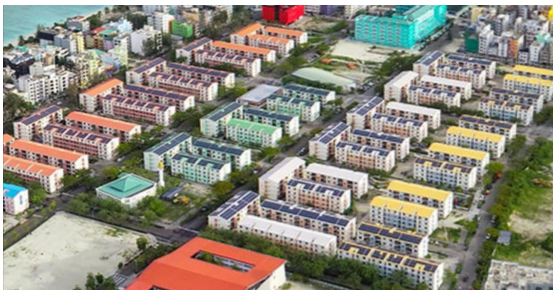
(Aerial View of the Plant)