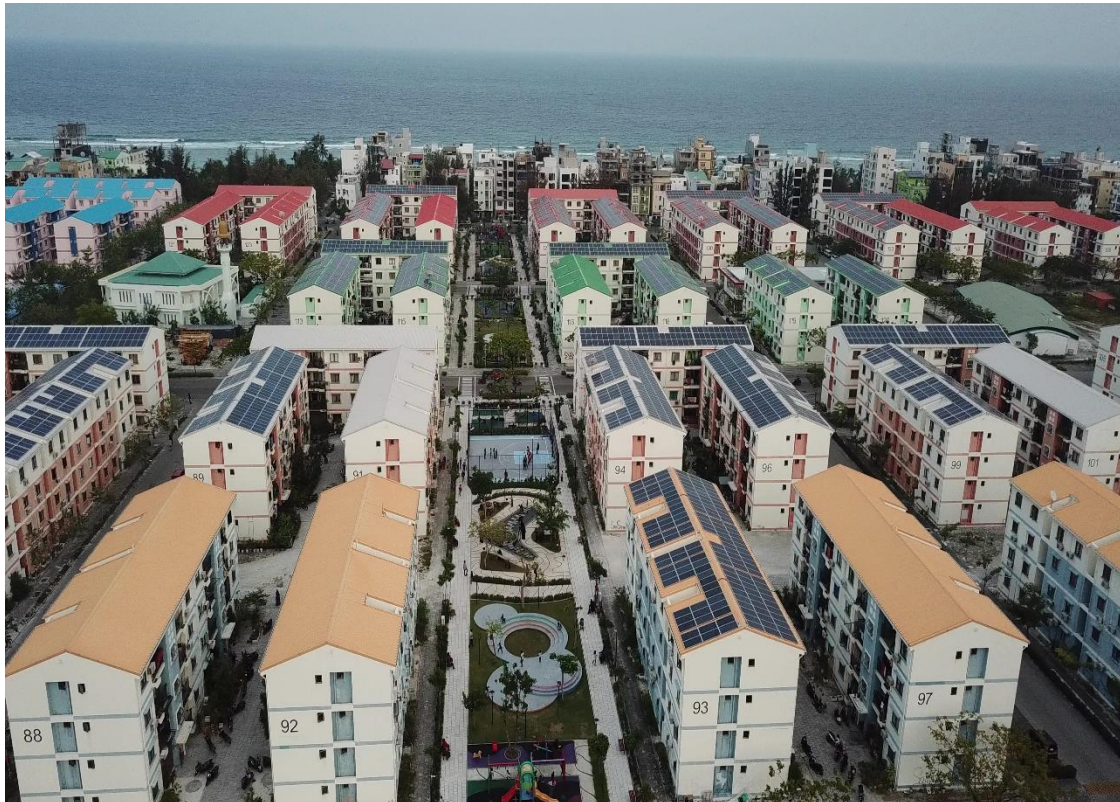
(Aerial View of the Plant)