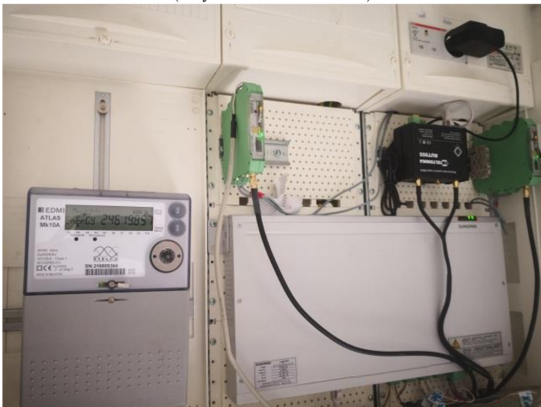
(Metering Device and Data Logger)