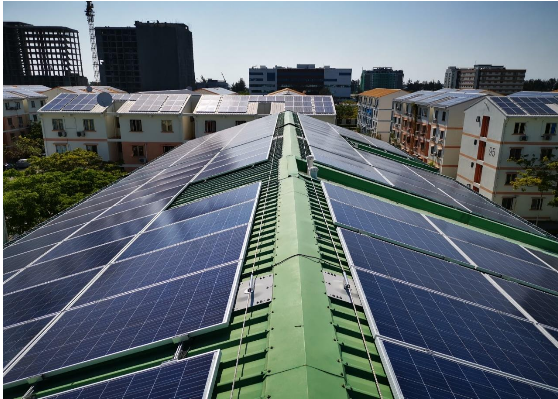
(PV Arrays on Roof)