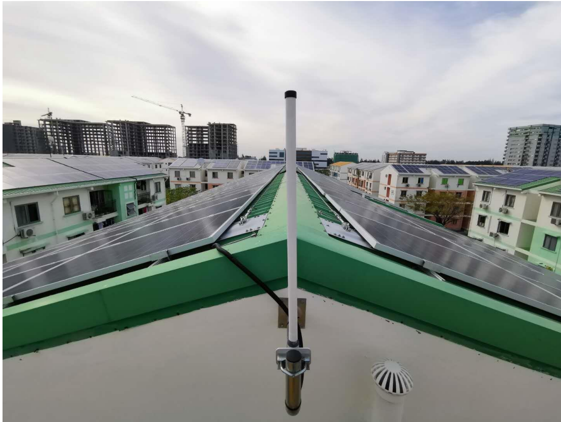
(Project Wireless Terminal)