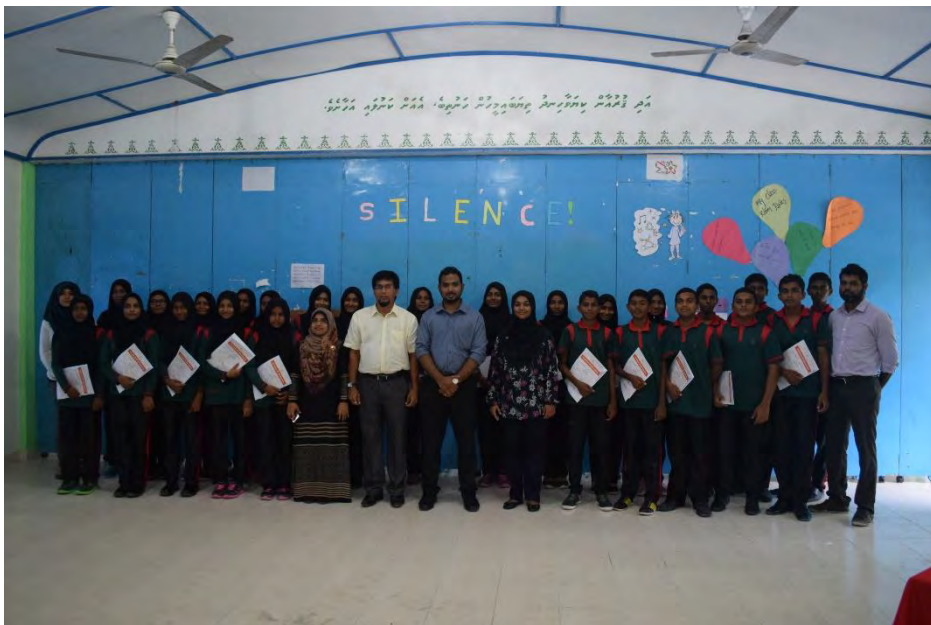
Figure 2: Students of Funadhoo School (Batch 2)