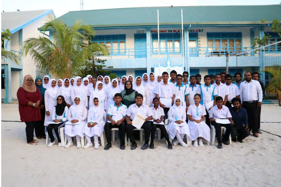
Figure 1: Students of Hinnavaru School (Batch 1)