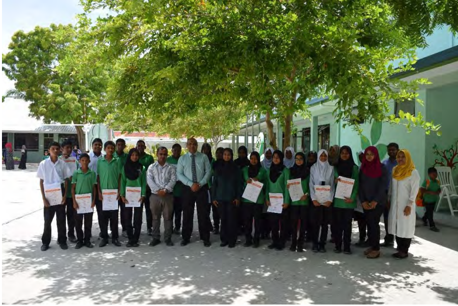
Figure 1: Students of Maafushi School (Batch 1)