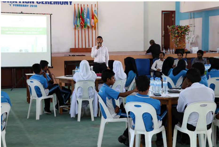
Figure 2: Students of ThimarafushiSchool (Batch 2)