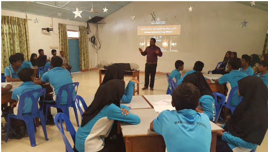
Figure 2: Students of Magoodhoo School (Batch 2)