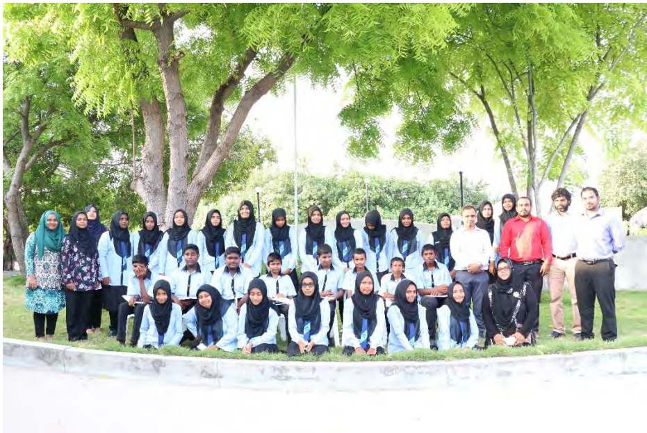
Figure 2: Students of Kendhikulhudhoo School (Batch 2)