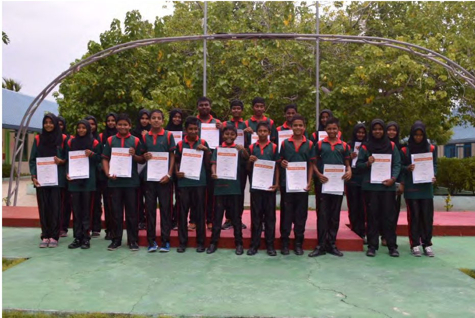
Figure 1: Students of Funadhoo School (Batch 1)