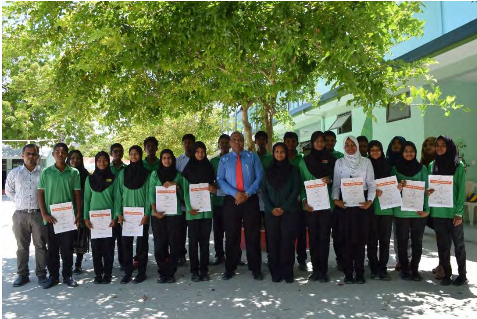
Figure 2: Students of Maafushi School (Batch 2)