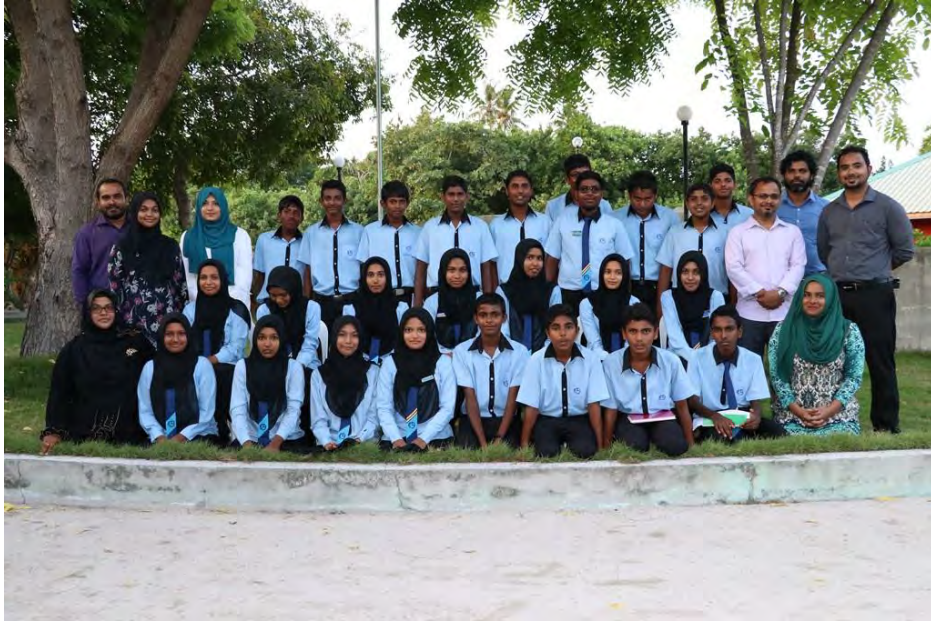
Figure 1: Students of Kendhikulhudhoo School (Batch 1)