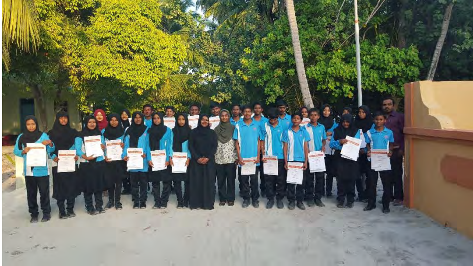
Figure 1: Students of Magoodhoo School (Batch 1)