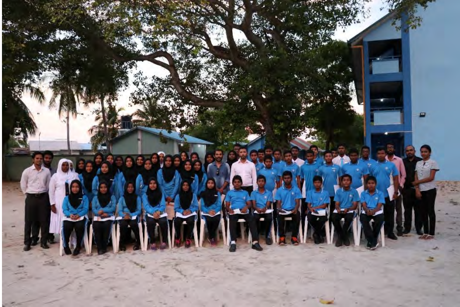
Figure 1: Students of ThimarafushiSchool (Batch 1)