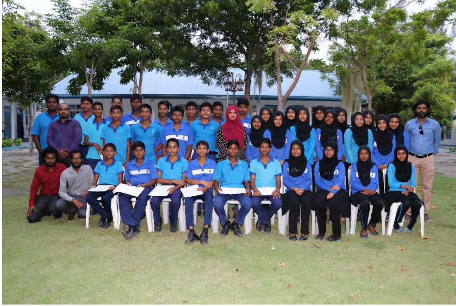
Figure 1: Students of Thoddoo School (Batch 1)