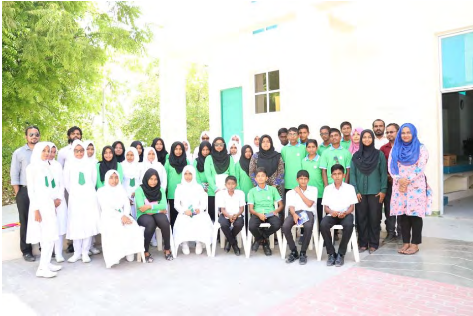
Figure 1: Students of Dhuvaafaru School (Batch 1)