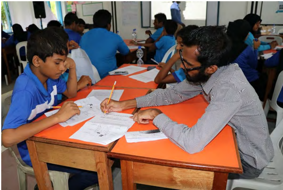
Figure 2: Students of Thoddoo School (Batch 2)