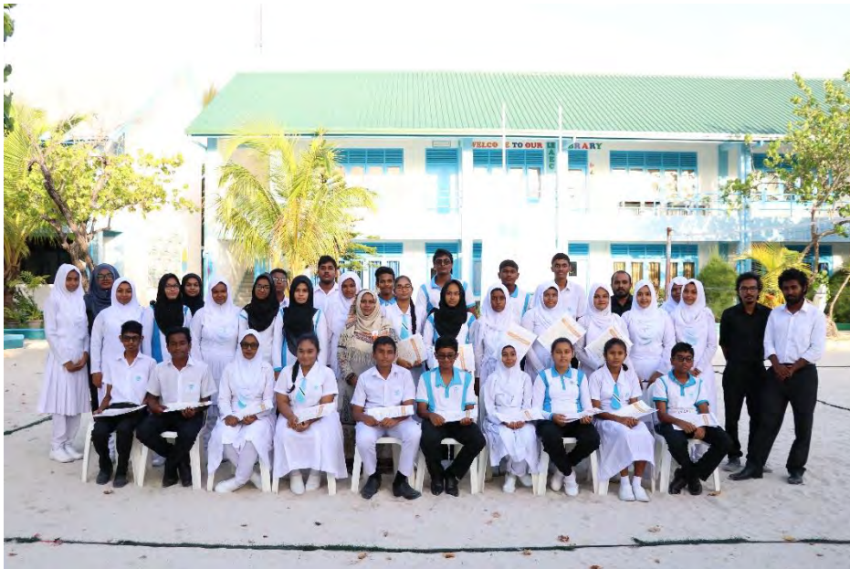
Figure 2: Students of Hinnavaru School (Batch 2)