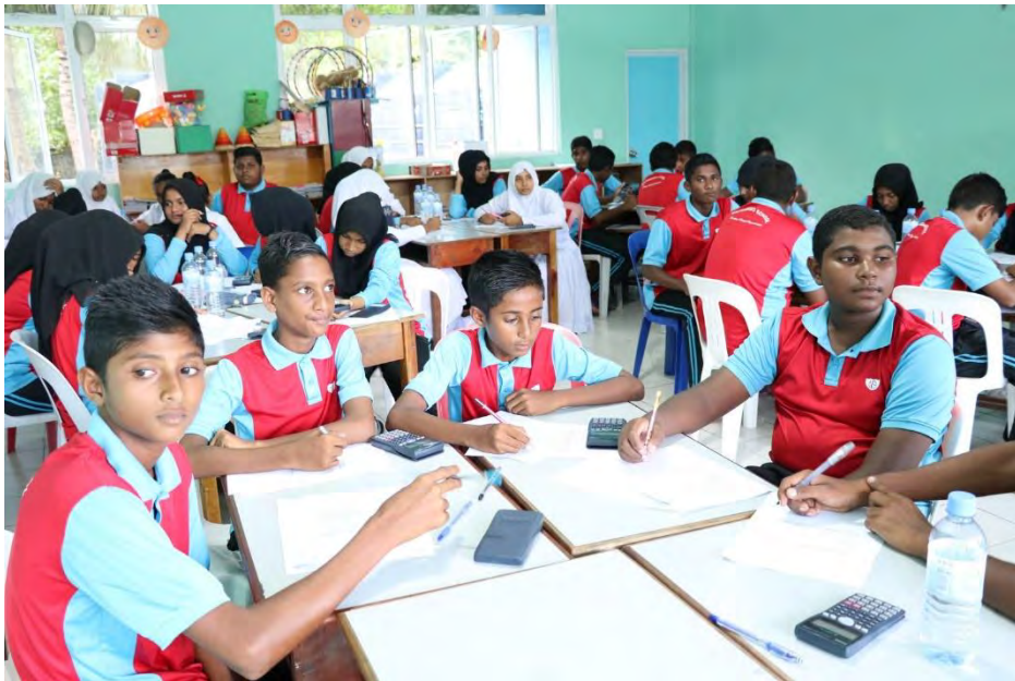
Figure 2: Students of Nilandhoo School (Batch 2)