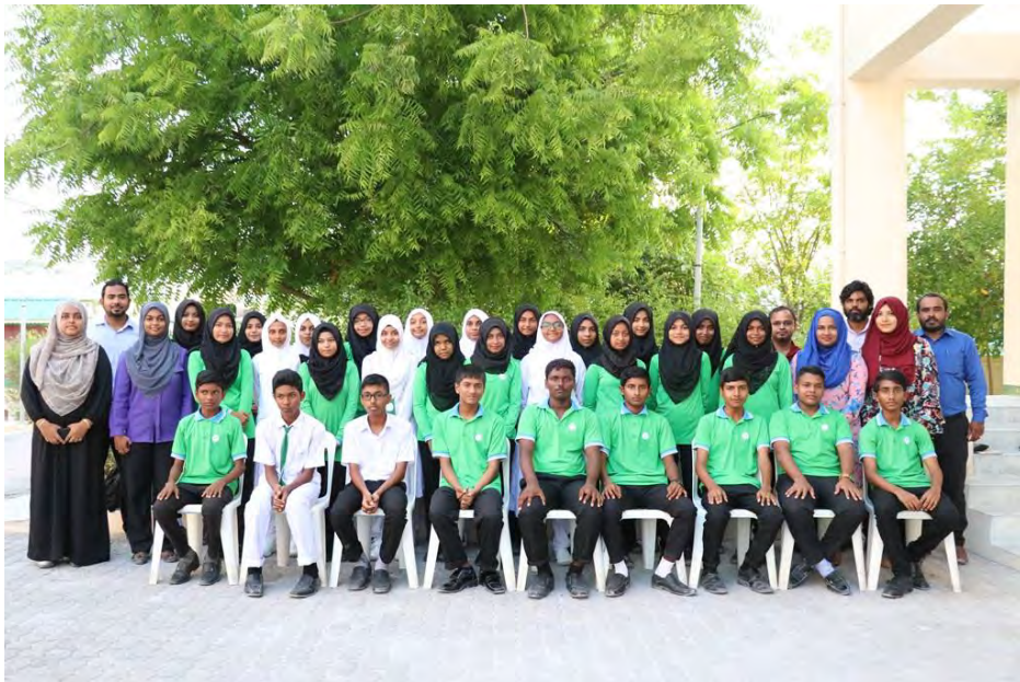
Figure 2: Students of Dhuvaafaru School (Batch 2)