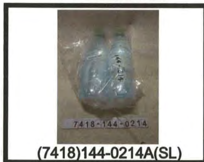
Photo of the Samples submitted

The content of this PDF file is in accordance with the original issued reports for reference only. This Test Report cannot be reproduced, except in full, without prior written permission of the company.