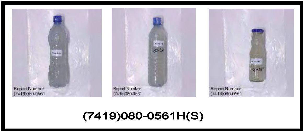
Photo of the Samples Submitted