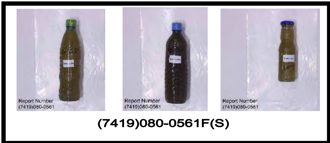
Photo of the Samples Submitted

Bureau Veritas Consumer Products Services Lanka (Pvt) Ltd.