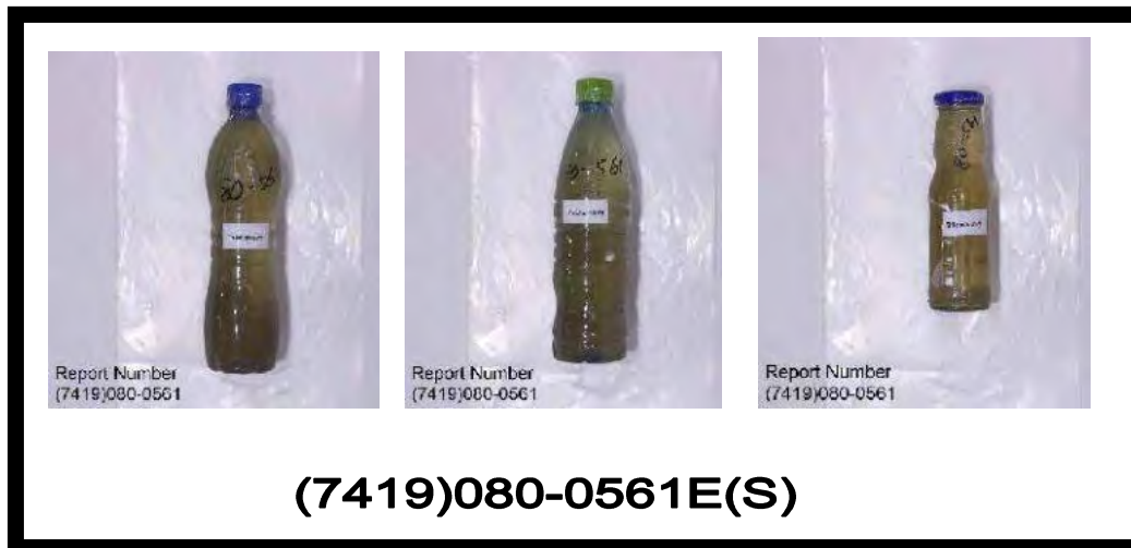
Photo of the Samples Submitted

Bureau Veritas Consumer Products Services Lanka (Pvt) Ltd.