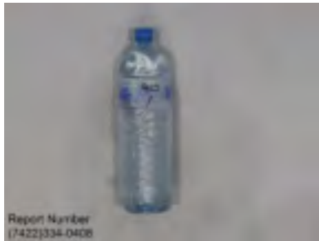
Photo of the Submitted Samples

Customer: Alke – Alkataş Joint Venture (Pvt) Ltd Address : H.H. Moomiyaage, 5A, Asaree Hingun 20265, K. Male', Maldives Date of Sample Received: Nov 30, 2022 Date of Testing Started: Nov 30, 2022 Date of Testing Completed: Dec 21, 2022 Sample Description: Sample Received as: A water samples contained in sealed glass & plastic bottles Sample Identified by the Client as: GW-01 1.5L x 2 Plastic Bottles & 1L x 2 Glass Bottles Sample Drawn By BVCPS NO