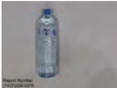
Photo of the Submitted Samples

Customer: Alke – Alkataş Joint Venture (Pvt) Ltd Address : H.H. Moomiyaage, 5A, Asaree Hingun 20265, K. Male', Maldives Date of Sample Received: Nov 30, 2022 Date of Testing Started: Nov 30, 2022 Date of Testing Completed: Dec 21 , 2022 Sample Description: Sample Received as: A water samples contained in sealed glass & plastic bottles Sample Identified by the Client as: GW-04 1.5L x 2 Plastic Bottles & 1L x 2 Glass Bottles Sample Drawn By BVCPS NO