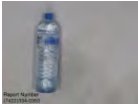
Photo of the Submitted Samples

Customer: Alke – Alkataş Joint Venture (Pvt) Ltd Address : H.H. Moomiyaage, 5A, Asaree Hingun 20265, K. Male', Maldives Date of Sample Received: Nov 30, 2022 Date of Testing Started: Nov 30, 2022 Date of Testing Completed: Dec 21, 2022 Sample Description: Sample Received as: A water samples contained in sealed glass & plastic bottles Sample Identified by the Client as: GW-02 1.5L x 2 Plastic Bottles & 1L x 2 Glass Bottles Sample Drawn By BVCPS NO