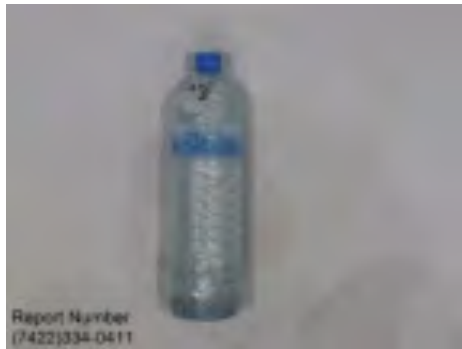
Photo of the Submitted Samples

Customer: Alke – Alkataş Joint Venture (Pvt) Ltd Address : H.H. Moomiyaage, 5A, Asaree Hingun 20265, K. Male', Maldives Date of Sample Received: Nov 30, 2022 Date of Testing Started: Nov 30, 2022 Date of Testing Completed: Dec 21, 2022 Sample Description: Sample Received as: A water samples contained in sealed glass & plastic bottles Sample Identified by the Client as: GW-08 1.5L x 2 Plastic Bottles & 1L x 2 Glass Bottles Sample Drawn By BVCPS NO