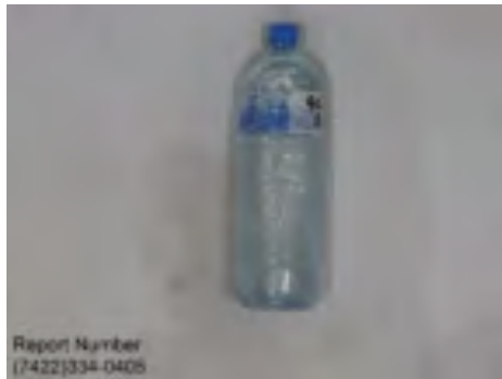
Photo of the Submitted Samples

Customer: Alke – Alkataş Joint Venture (Pvt) Ltd Address : H.H. Moomiyaage, 5A, Asaree Hingun 20265, K. Male', Maldives Date of Sample Received: Nov 30, 2022 Date of Testing Started: Nov 30, 2022 Date of Testing Completed: Dec 21, 2022 Sample Description: Sample Received as: A water samples contained in sealed glass & plastic bottles Sample Identified by the Client as: GW-06 1.5L x 2 Plastic Bottles & 1L x 2 Glass Bottles Sample Drawn By BVCPS NO