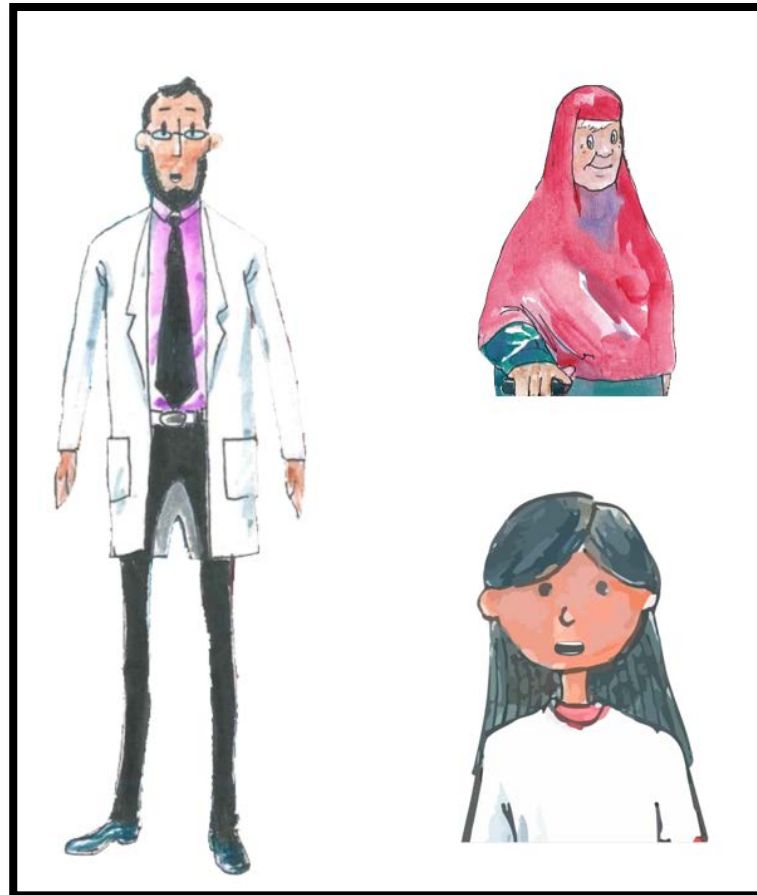
Figure 1: Characters to be used in the posters