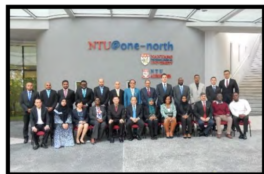
Energy Efficiency training program conducted in Singapore