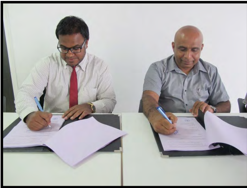
Contract signing for the development of Educational Toolkit for Girl Guides and Scouts in the Maldives

The Scout Association of Maldives is a member of the World Organization of Scout Movement (WOSM), since 23 July 1990. The mission of Scouting is to contribute to the education of young people, through a value system based on the Scout Promise and Law to help build a better world where people are self-fulfilled as individuals and play a constructive role in society.