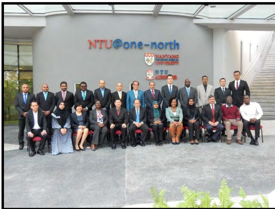
Training session in Singapore cooperation programme

The participants of the training were provided information about challenges in technological integration, project financing, and carbon tax/trading as well as multilateral collaborative opportunities for mitigating the impact of climate change and other environmental concerns.