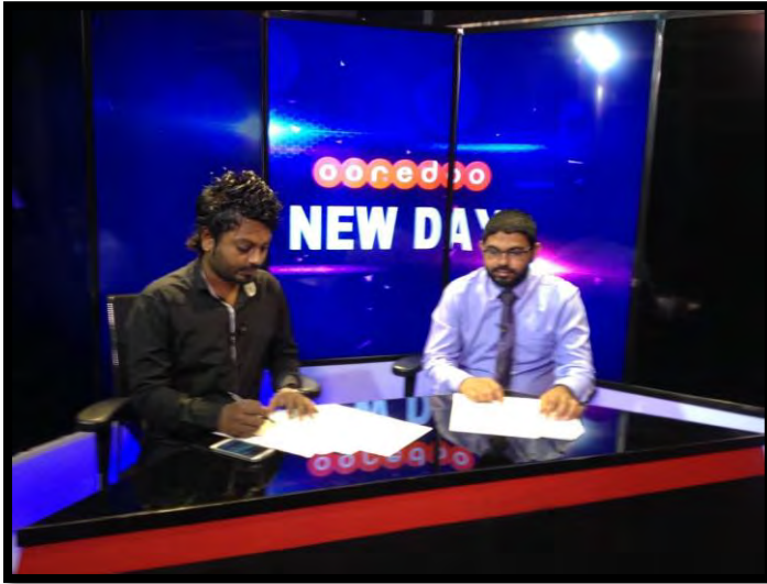
Providing information on Ooredoo Newday program of Dhifm about the deadline extension of Energy Efficiency Art Competition

9 th July 2016 - The deadline for art work submission of “Energy Efficiency Art Competition” was extended to 12:00 pm of 19 th July 2016. The original deadline was 4 th July 2016. It was extended due to the request from many schools, especially the schools in islands.