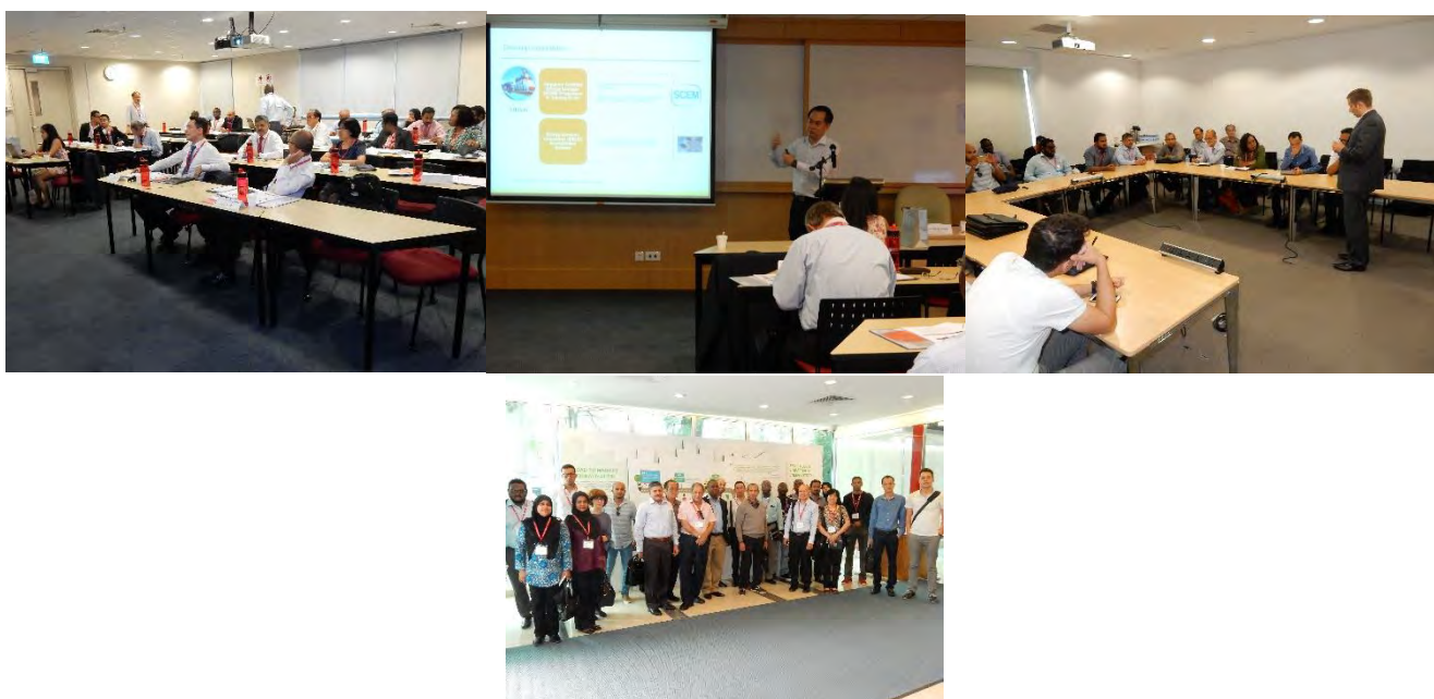
Energy Efficiency training conducted in Singapore