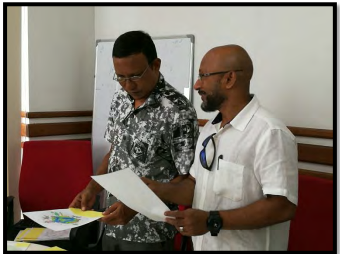
Energy Efficiency Art Competition judging