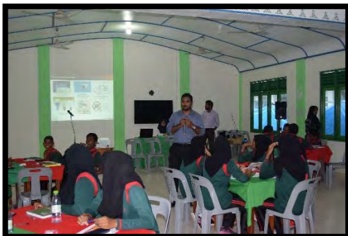
Awareness Workshop on Energy Efficiency held at Shaviyani Atoll Funadhoo School