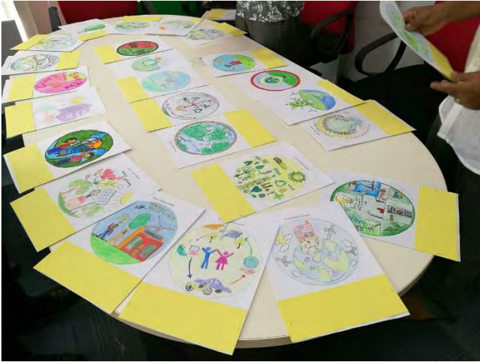
Energy Efficiency Art Competition judging

22 nd August 2016 - The judging of "Energy Efficiency Art Competition 2016" was held on 22 August. The judging panel included the representatives from United Artists of Maldives (UAM) and Ministry of Environment and Energy.