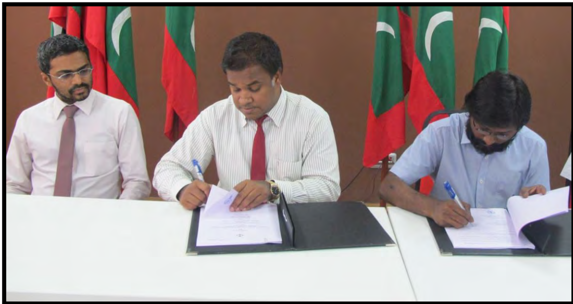
Contract signing to develop energy efficiency awareness video spots

These video spots will be used in several media platforms to increase the awareness on energy efficiency.