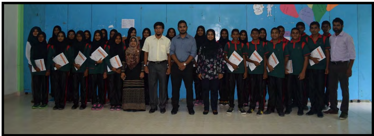
Group photo taken after the completion of the workshop held at Sh.Funadhoo School

In the workshop, information was given on energy efficiency, ways to be more energy efficient, how to conserve energy and importance of energy efficiency in building design to reduce GHG emissions. Exercises were conducted to provide knowledge on power consumption of equipment and power consumption of buildings.