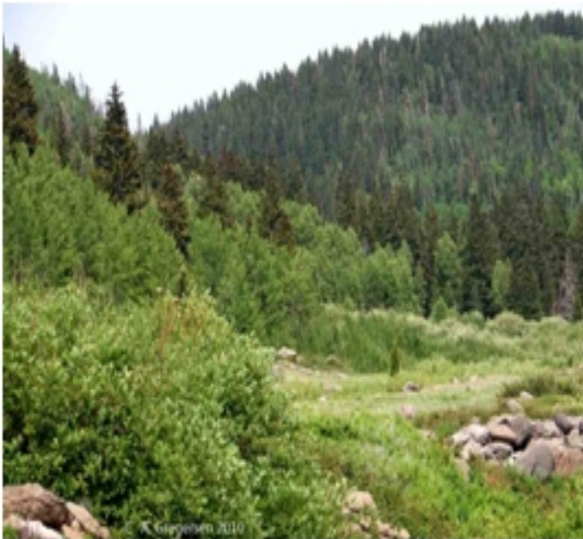
A healthy, beautiful forest.....

Forests contain the majority of animal and plant life of the world. If the forests are wiped out, we will lose millions of different species of plants and animals, some of which have yet to be discovered. In addition to this, it will have a detrimental effect on all the ecosystems of the world, including our own. It will affect our food chain, among other things.