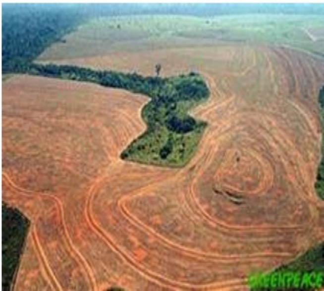
.....looks like this after deforestation.

Trees keep the amount of carbon dioxide in the atmosphere at a low level. But due to deforestation, a large number of trees are lost. Thus, the amount of carbon dioxide and other greenhouse gases is increasing at an alarming rate. When the Sun's heat enters the Earth's atmosphere, most of it is reflected back, but the greenhouse gases trap some of the heat and make the Earth warmer. This is known as the greenhouse effect, which causes global warming.