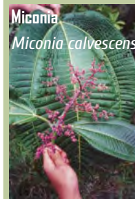
Miconia Miconia calvescens